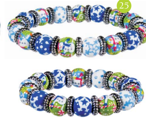
snappy snowmen (silver accents)

ME220919 petite $45 ME20203 little girls $35