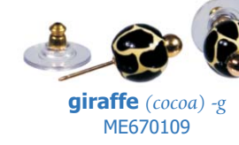
giraffe (cocoa) -g ME670109