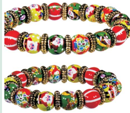
santa's surprise (golden accents)

ME220808 petite $45 ME220304 little girls $35