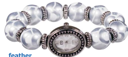
grande classic bead watch $150

we've turned our favorite themes into fun timepieces or functional fashion. classics measure 7 1/2" around your wrist ... grandes measure a tiny bit bigger, 7 3/4" and feature a gold or silver plated case and quartz movement, with a one year warranty.