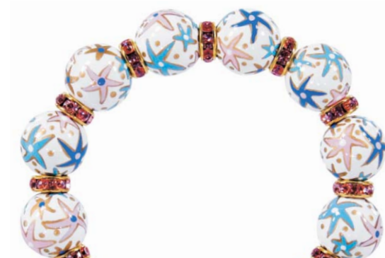
STARFISH pearl rf

ME231516 bracelet $65 ME331516 necklace $115