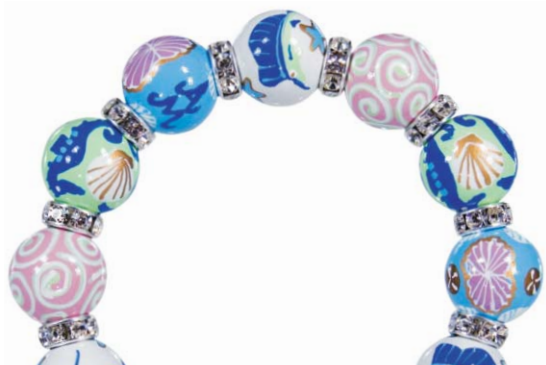
SEA SENSATION rf

ME231769 bracelet $65 ME331769 necklace $115