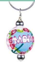
mamma mia AMC40685