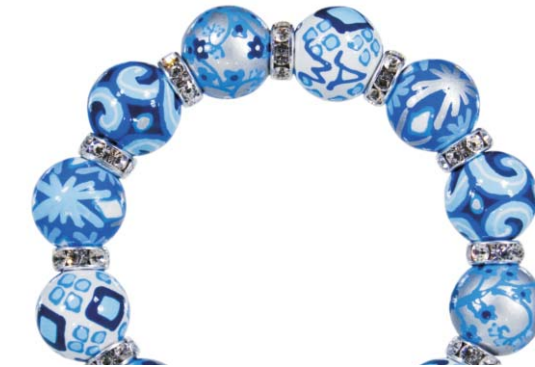
SUNRISE SHIMMER rf

ME231834 bracelet $65 ME331834 necklace $115