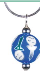
gorgeous golf AMC40690