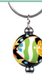
hot tropics AMC40643