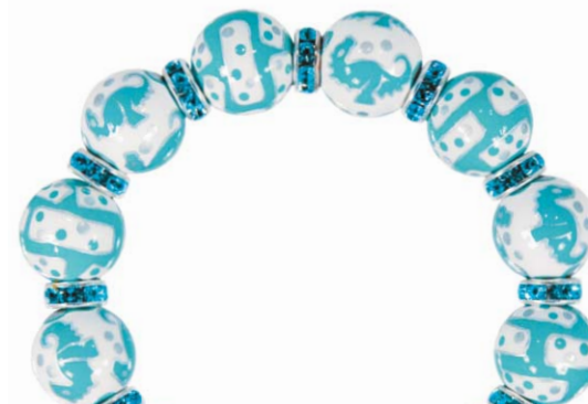
SASSY SEAHORSE rf

ME231313 bracelet $50 ME331313 necklace $100