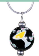
cocktail time AMC40738