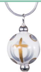
count your blessings AMC40739