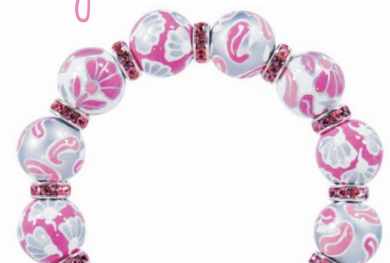
FRENCH LACE pink

ME231826 bracelet $65 ME331826 necklace $115