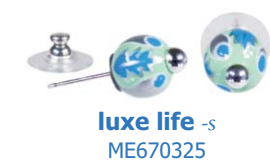
luxe life -s ME670325