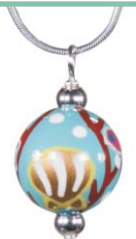
coral reef AMC40717