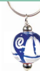
sail away AMC40710