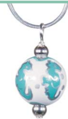
sassy seahorse AMC40720