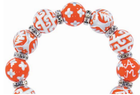
DESERT BLOOM spice

ME231543 bracelet $65 ME331543 necklace $115