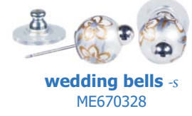
wedding bells -s ME670328