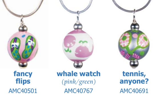
fancy flips AMC40501