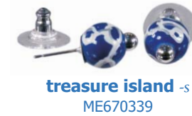
treasure island -s ME670339