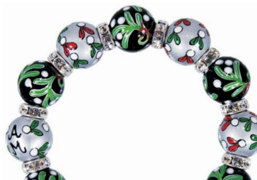
silver bells -s ME640913