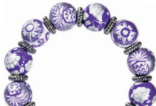
PINEAPPLE MEDLEY purple

ME230990 bracelet $65 ME330990 necklace $115