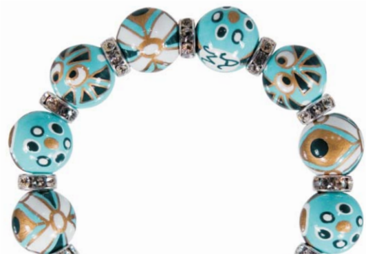
THAT'S AMORÉ rf

Classic graphics in terrific turqs, nifty navy and go to gold ... all with clear crystals. That's Amoré! Fab with Bella Luna. (silver accents)