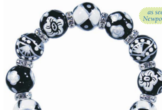
PLAZA NIGHTS black/silver

ME231504 bracelet $65 ME331504 necklace $115