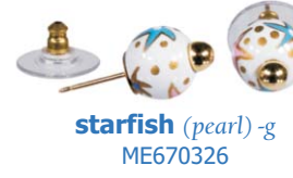
starfish (pearl) -g ME670326