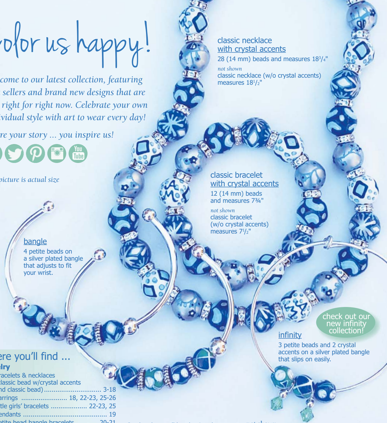
classic necklace with crystal accents 28 (14 mm) beads and measures 18 3 / 4 " not shown classic necklace (w/o crystal accents) measures 18 1 / 2 "