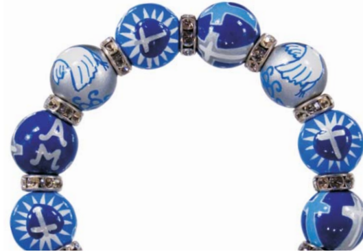
UNITED BY LOVE rf

ME230347 bracelet $50 ME330347 necklace $100