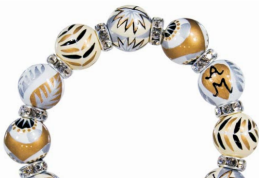
CAFÉ AU LAIT

ME231715 bracelet $65 ME331715 necklace $115