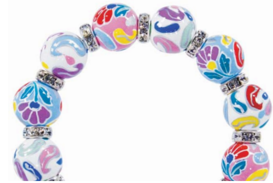
FRENCH LACE multi

ME231762 bracelet $65 ME331762 necklace $115