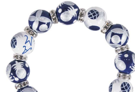
PINEAPPLE PATCH navy/silver

ME231542 bracelet $65 ME331542 necklace $115