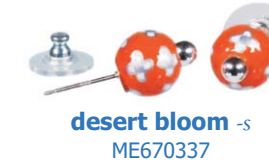
desert bloom -s ME670337