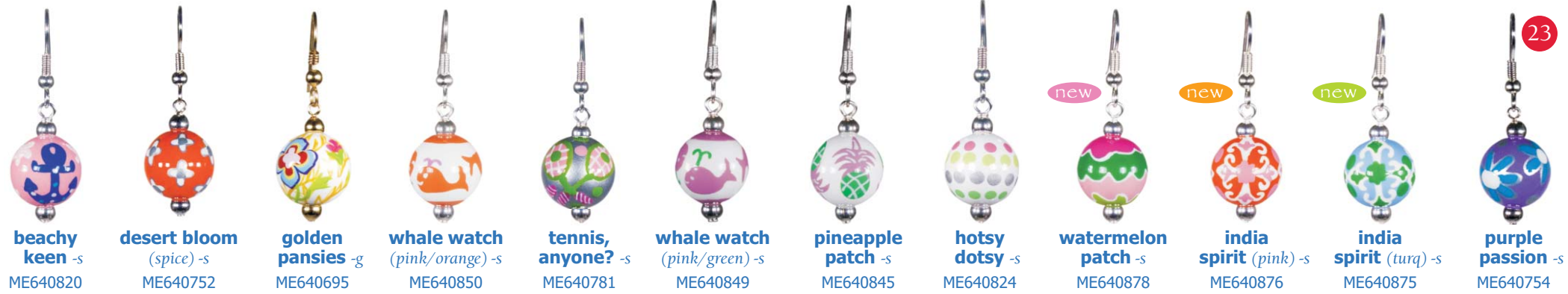
beachy keen -s ME640820

all earrings are either gold (-g) or silver filled (-s) earwires or posts