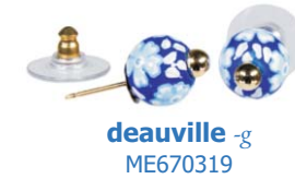
deauville -g ME670319