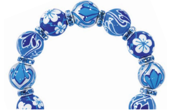
BLUE HEAVEN rf

ME231763 bracelet $65 ME331763 necklace $115