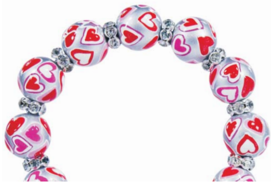
LOVE AND KISSES

Celebrate your heart's desire with Love and Kisses in hot pink, romantic red and sentimental silver, with clear crystals to complete the story. (silver accents)