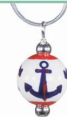
anchors away (navy/red) AMC40765