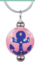
beachy keen AMC40737