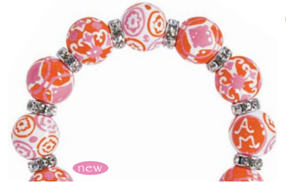
INDIA SPIRIT pink/orange

ME231858 bracelet $65 ME331858 necklace $115