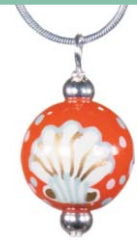
island shells AMC40744