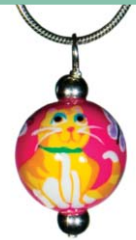
kitty witty's 9 lives AMC40608