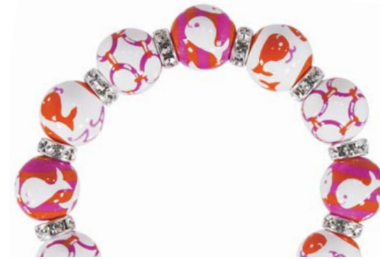
WHALE WATCH pink/orange

ME231764 bracelet $65 ME331764 necklace $115