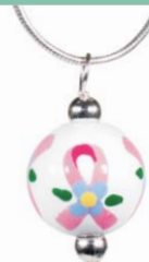
pink ribbon AMC40629