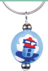
lighthouse lane AMC40636