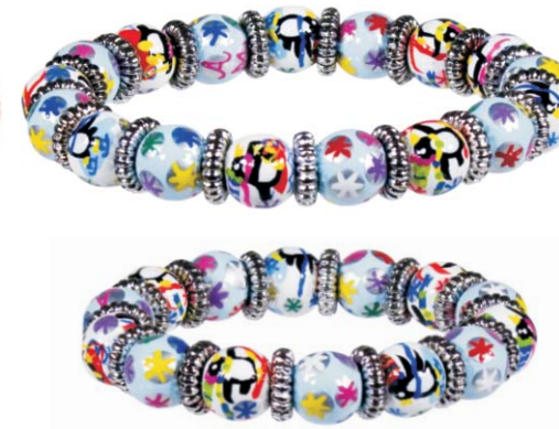
polar penguins (silver accents)

ME220808 petite $45 ME220304 little girls $35