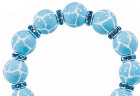
GIRAFFE aqua rf

ME231410 bracelet $65 ME331410 necklace $115