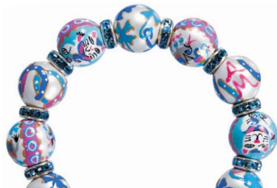
LUCKY DAY rf

Make this your Lucky Day with our special collection of good luck symbols. Pale pastels set on pearly white with aquamarine crystals. (silver accents)