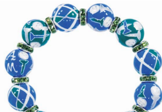
GORGEOUS GOLF rf

Make that putt in style with Gorgeous Golf to give you good luck on the green and on the 19th hole! Peridot crystals are smooth, just like your short game! (silver accents)