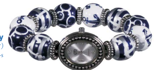
anchors away (navy/silver) ME14050 -s