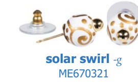
solar swirl -g ME670321