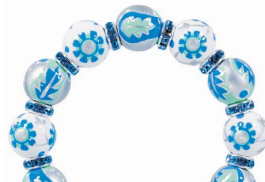
LUXE LIFE rf

ME231545 bracelet $65 ME331545 necklace $115