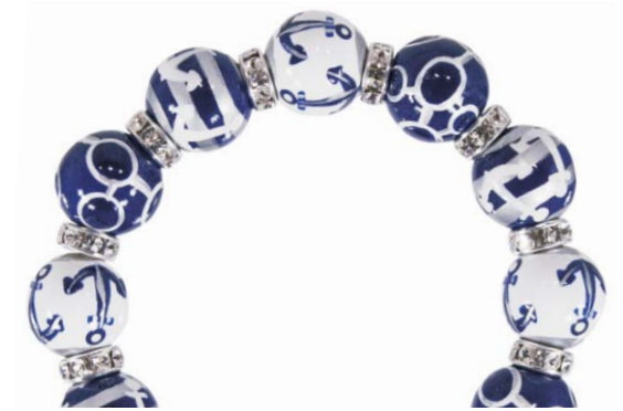
ANCHORS AWAY navy/silver

ME231850 bracelet $65 ME331850 necklace $115